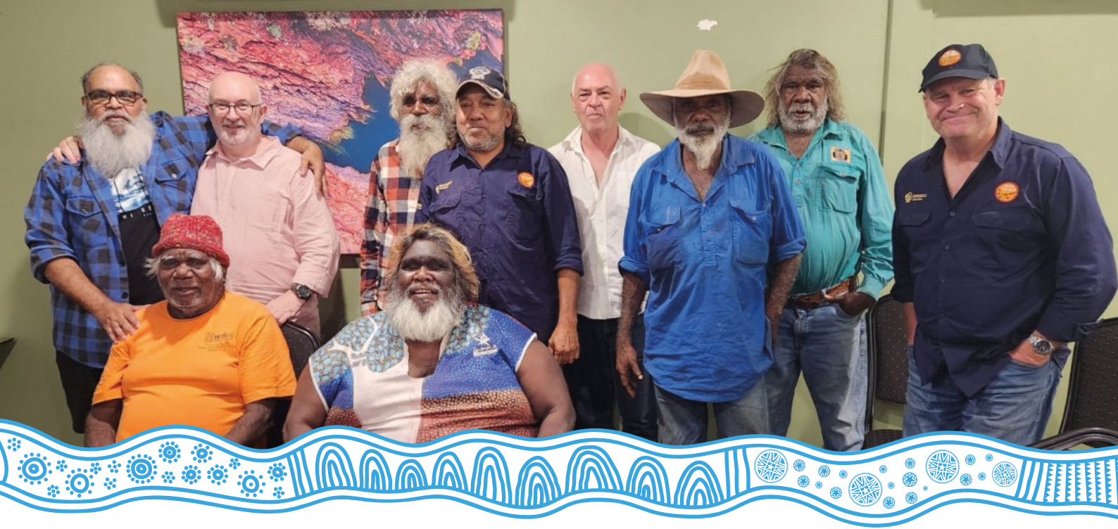
Martu Justice Reinvestment Tribal Council in Newman, Western Australia

However, while relationships are strengthening with some governments, communities still face barriers in all jurisdictions to realising full selfdetermined community control.