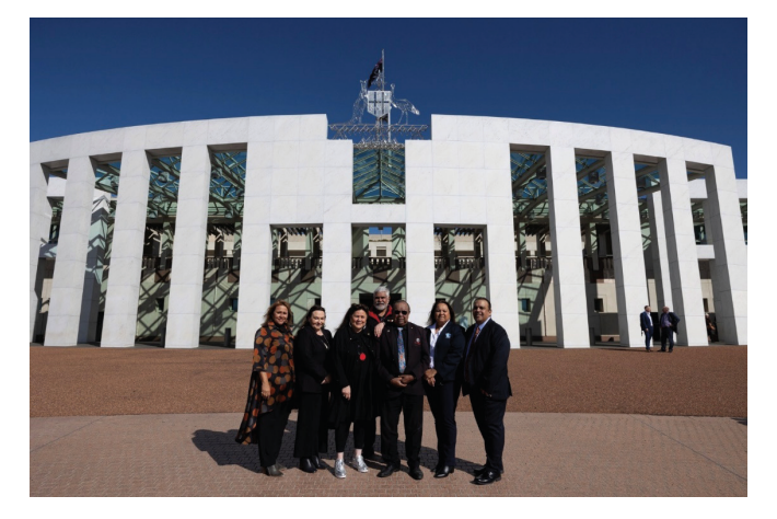
NATSIAACC Founding Board of Directors at Parliament House, Canberra

Decisions are made as a collective, with leadership rooted in unity, connection, trust, identity, understanding and self-determination, where First Nations voices are respected and uplifted.