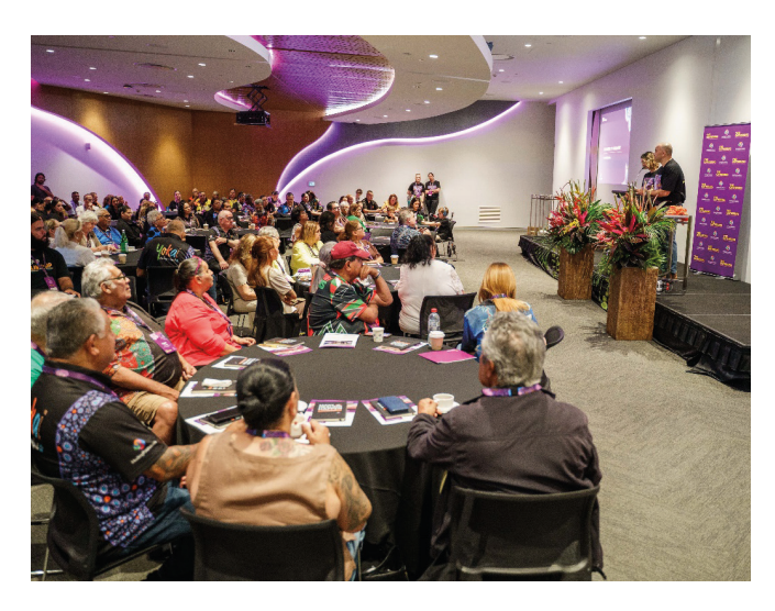
Stolen Generations survivors and organisations gather in Garramilla in September 2024

My aunties were taken. And as a child, I saw my father's distress at hearing their stories of pain, paying witness to a truth that had been so long denied in this country, that is tragically yet again being denied in the wake of the Voice Referendum and dismantling of truth-telling processes.