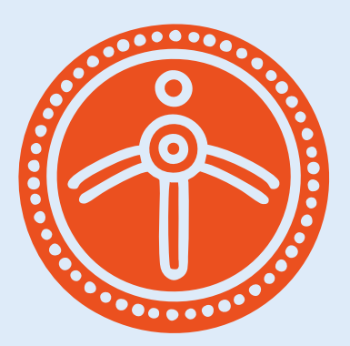
Agency and Self-Determination

Closing the gap between Aboriginal and Torres Strait Islander and non-Indigenous people requires a concerted effort, grounded in the three themes of this report: Agency and Self- Determination ; Leadership and Solidarity ; and Reform and Transformation .